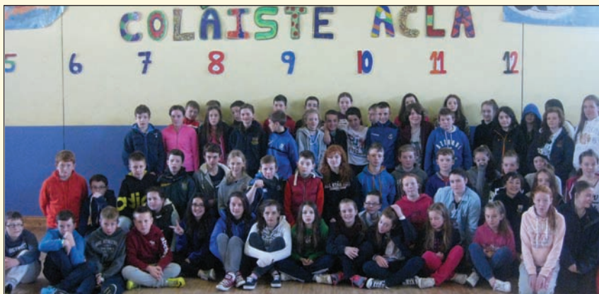
Moate CS 1st year students who travelled to the Gaeltacht recently

On the 7th of November 65 first year students went to Coláiste Acla in the Mayo Galtacht for the weekend. This was a three day two night adventure package all conducted as Gaeilge. On arrival students were split into two groups. One group went Bog Snorkelling while the other participated in Gorge Walking which involved obstacles in a river. Students were then brought to the Bean an Tí house and later participated in Ranganna Gaeilge and an céilí. The next day students went surfing and kayaking and later participated in more Ranganna Gaeilge before the last céilí. This was a wonderful experience for all involved.