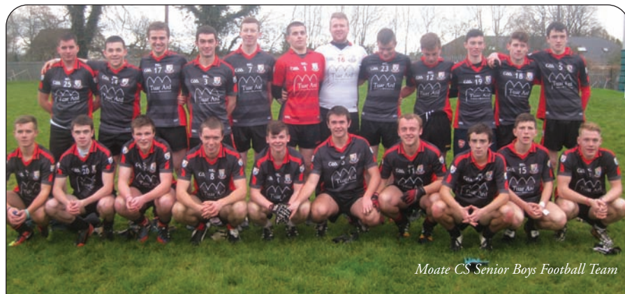
Moate CS Senior Boys Football Team

Well done to our senior boys who defeated Maynooth Schools in the first round of the championship on Friday the 12th of December in Moate, on a scoreline of 1-15 to 2-4. We look forward to a successful campaign in 2015.