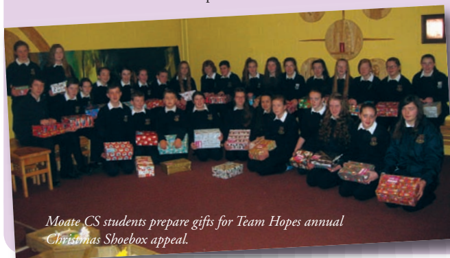
Moate CS students prepare gifts for Team Hopes annual Christmas Shoebox appeal.

MCS students took part in the annual Team Hope Christmas shoe box appeal. The shoe boxes are delivered to children in poverty stricken areas across Africa and Eastern Europe.