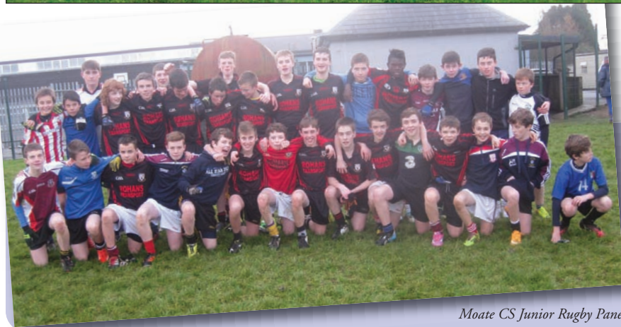
Moate CS Junior Rugby Panel