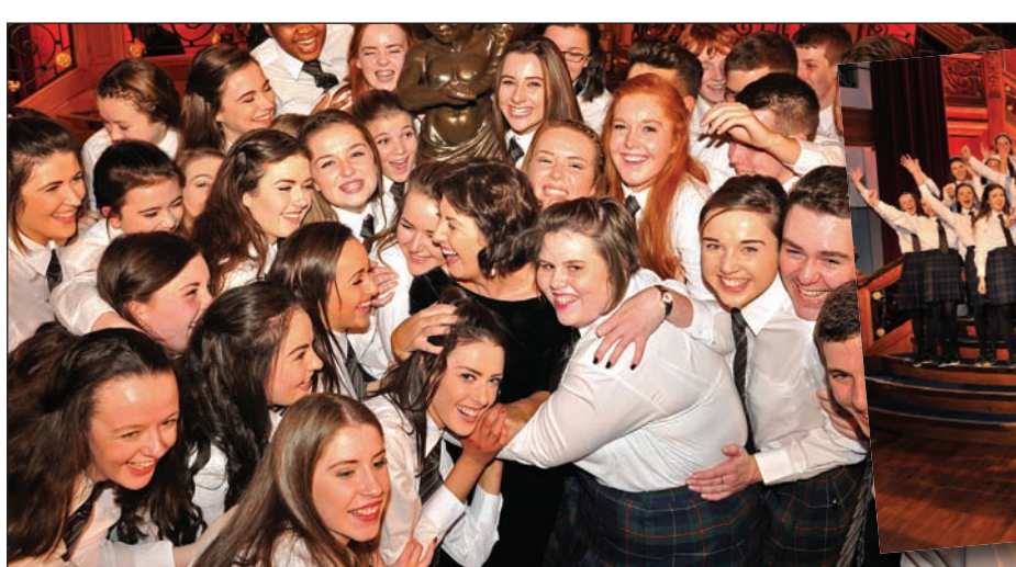
Jubliant secens as MCS choir celebrate their victory