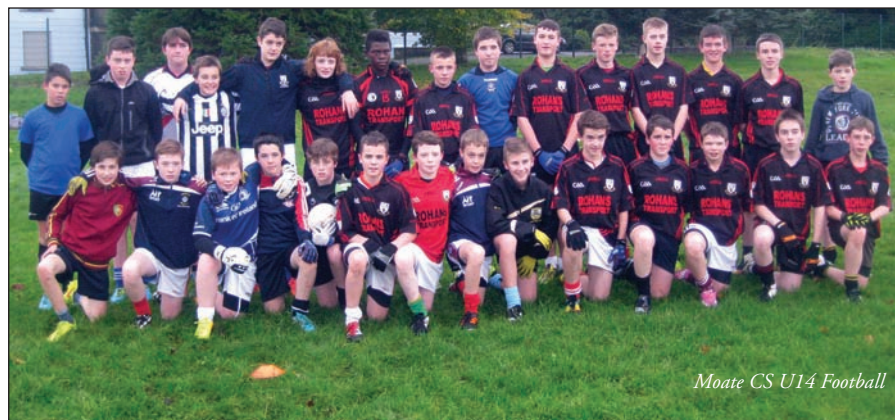
Moate CS U14 Football