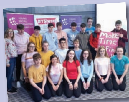
TY students with their teachers at the YSI Speak Out.

The day was a great success for all involved, and especially for our TY3 class, whose performance earned them the Most Creative & Passionate Performance award. Well done to all the TY students and teachers involved.