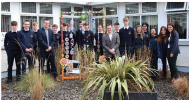
Moate CS TY students unveil sensory area.

words on the school's impressive actions towards an autism-friendly community. Our class wants people to realise that those who are different don't have to be hidden away, they don't have to isolate themselves from society, and that if they are given the