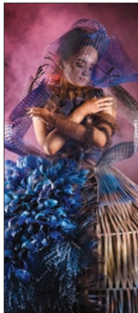
Go With The Flow