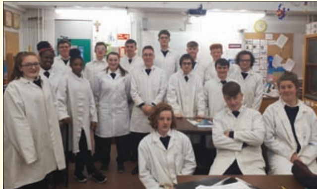
Sixth Year Chemistry class.

The workshop gave the students the opportunity to observe the analytical Chemistry equipment in action. It brought scientific principles to life. The workshop was organised in a fun and interactive way that made abstract theories easy to understand. As many students had never been in an industrial laboratory, the opportunity to partake in a workshop such as this one is an invaluable asset that will give the students an edge in the Leaving Certificate exam.