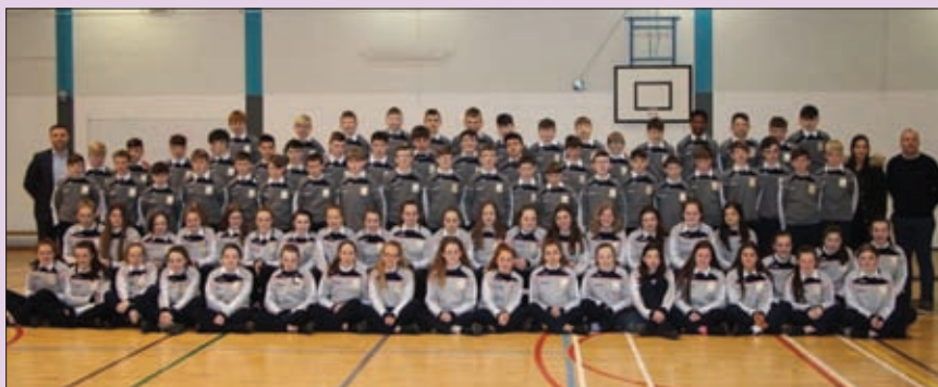
U14 Junior Sports Academy.