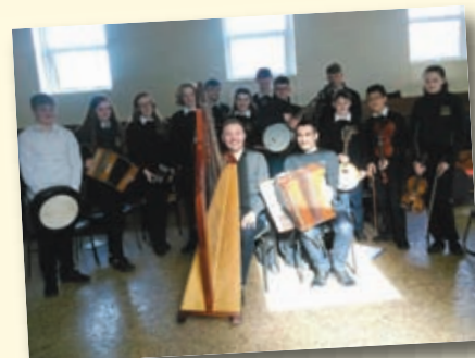
Traditional Music Workshop.