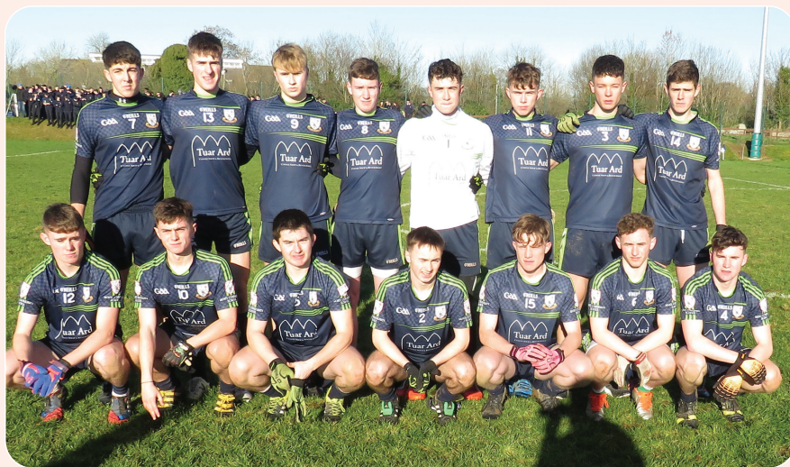
Senior Boys Football team.

This victory has secured a place for Moate in the Leinster Semi Final which will take place in January. We await with baited breath the outcome of Kilcock vs Good Counsel Wexford, the winner of which will play Scoil Mhuire, Mullingar to book the other place in the Leinster Semi Final. Well done lads!!