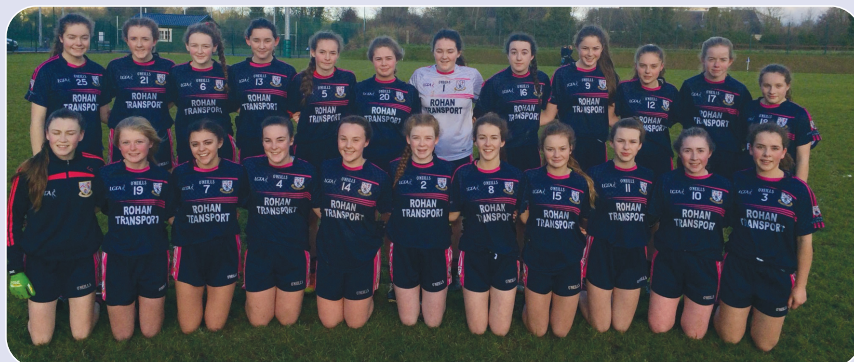
Moate Community School Girls U16 Football Panel.