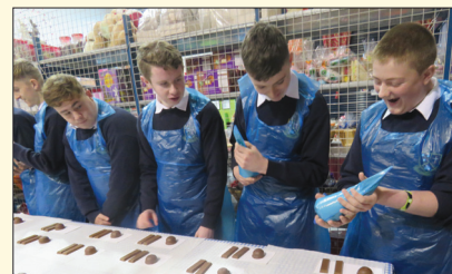
Moate CS Fifth Year lads try their hand at chocolate decorating.