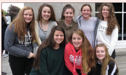
Moate CS TY Ladies attend Zeminar.

Zeminar: A life changing day for Generation Z - Around 80 of our TY students made the trip to the RDS in Dublin to attend this event. Zeminar can be described as an Interactive Health & Wellness Expo. It started off with students attending different workshops, networking with youth team leaders from all around Ireland and taking part in a range of activities which covered topics such as mental health, fitness, general well-being, careers, interests and hobbies. The day culminated in a highly anticipated talk from Irish TV personality, 'Niall Breslin', or, 'Bressie'. In his speech, Bressie laid his emotions on the table and bared his soul to a roomful of 1,000 (and even more watching from projectors outside the auditorium) and easily influenced young people in a gritty, deeply moving, honest account of his battle with mental health. Zeminar's emphasis on mental health had a huge influence on our TY's decision to attend as our school is in the process of becoming a 'Health Promoting School', and we mean to do this through promoting taking care of both our physical health and our mental health.