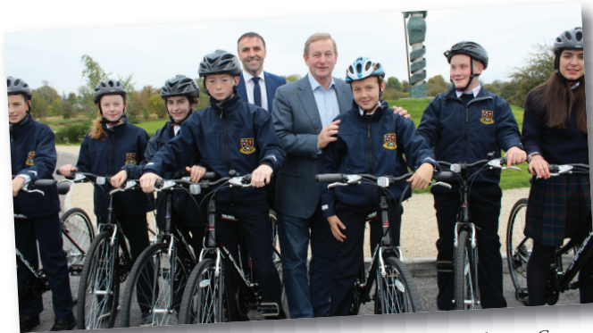
Students meet An Taoiseach Enda Kenny at the official opening of the new Greenway.